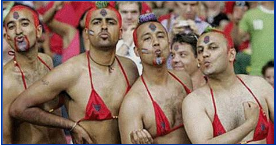
Cannibals fans pose for the cameras on Opening Day at the Killing Field in Carthage, American Samoa. The entire island showed up to see the game. Prolonged isolation from the main centres of civilization has fans starving for attention....and, some say, human flesh.

Opening Day in Carthage was quite a party. The entire island showed up, whether they had actual tickets or not. The general admission tickets were all purchased in advance by the Pentagon and