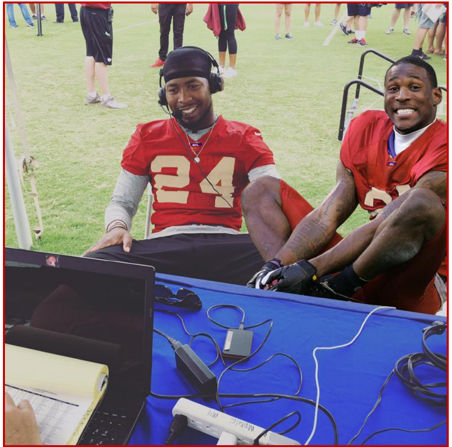
Josh Norman (left) and Patrick Peterson ham it up with reporters at their Muskoka training camp facility. The best shutdown corner tandem in the league must stay healthy, because there is nobody behind them.