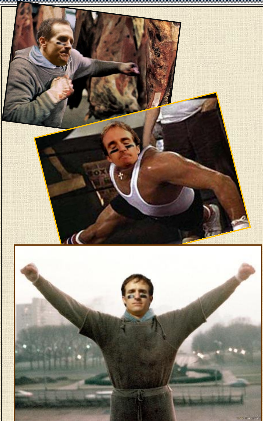
It was a rocky road for Drew Brees in 2014 but after an off-season of intense training he claims to feels better than ever in 2015.

Not in dispute in any analysis of the Aurora offence is the view of Matt Ryan as an emerging elite quarterback. In 2014 he finished 5 th in passer rating (106.1), 2 nd in total yards passing (4,627), and 1 st in TD passes (43) while the offence he piloted hung 545 points on their opponents, the second most points scored in EFL history. With a championship ring on his