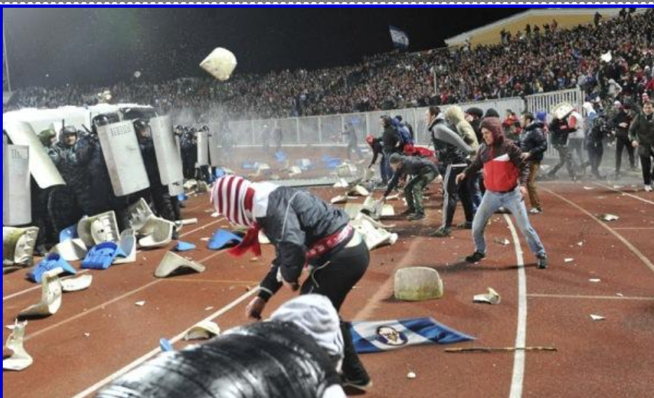
Outraged Blue Eagles' fans battle Toronto Police at Bluffs Stadium at the end of the 2013 season. Disappointment is an understatement when describing the feelings of football fans in Scarborough.