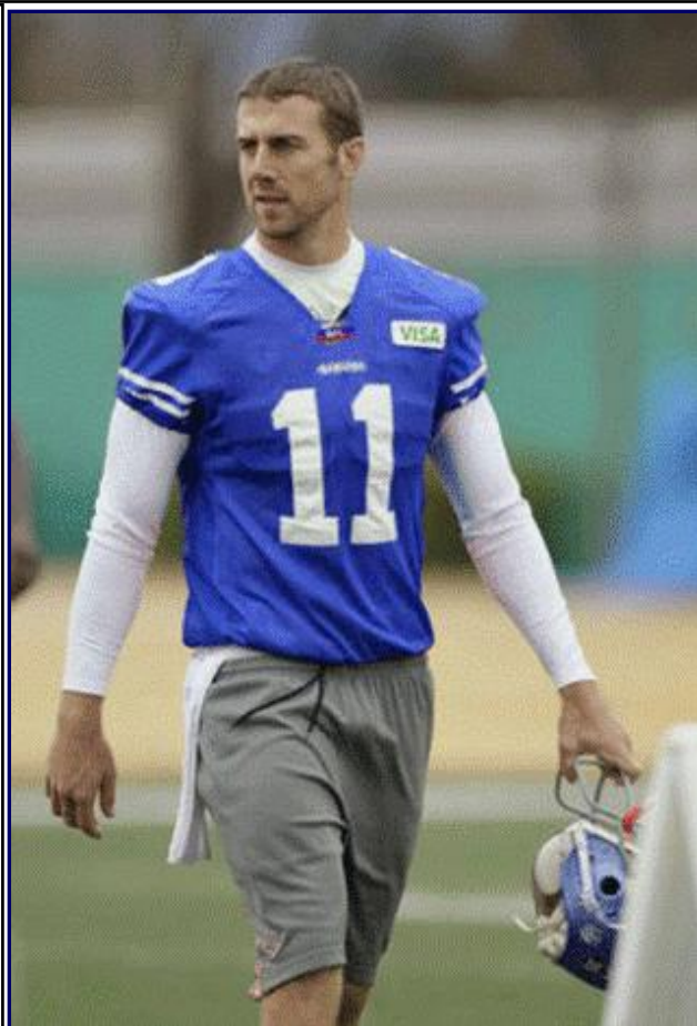
Los Angeles QB, Alex Smith has a tough act to follow. Can he equal Freeman's achievement and lead the Knights back to the Championship Game?