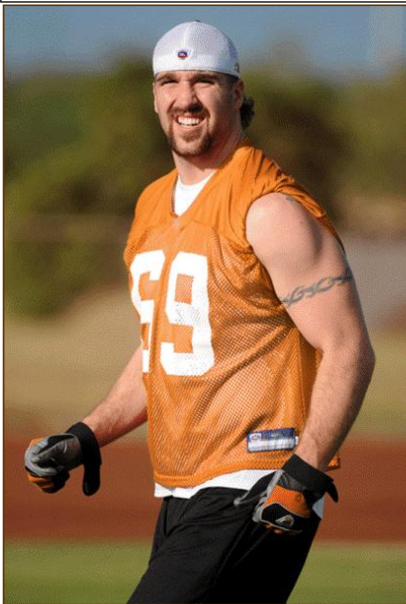
A relaxed Jared Allen glides through non-contact workouts in training camp OTAs. The Dinos' premier pass rusher is in a contract year and taking aim at enemy quarterbacks.