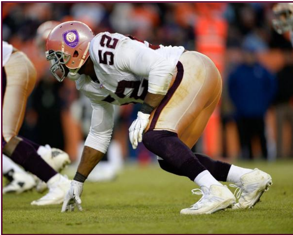
Monarch linebacker, Khalil Mack lines up during Week 9 action at Tillman Field in Cowtown. The 2014 1 st round pick is exceeding expectations in his second year in the league. He recorded 8 tackles and 3 sacks in a 27-24 OT win over Cowtown.

may change in wake of the bizarre chain of events that led to the Regulators' 6 th loss of the season.